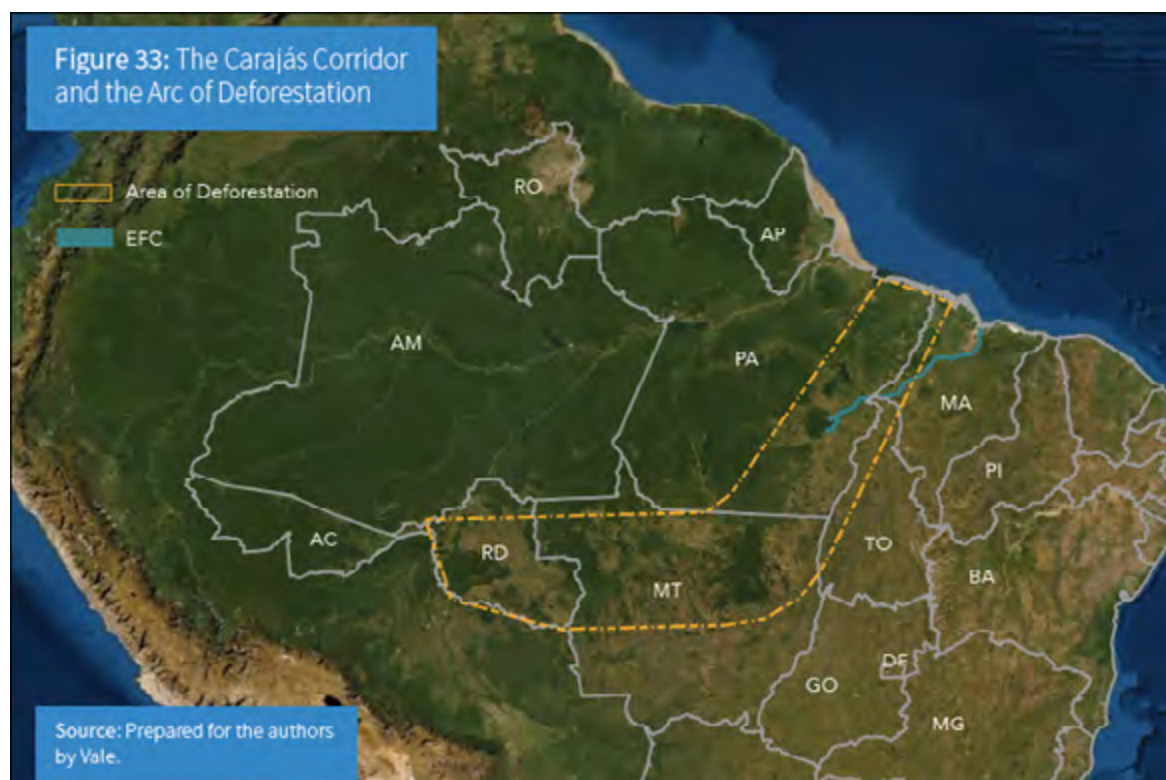
Figure 20.3 The Carajás corridor and the arc of deforestation

region and the Cerrado, as well as across economic sectors. It could have predicted the cumulative pressures of deforestation resulting from pig-iron production, urbanization and other economic activities, from the short to the long term. Given that the connection of the EFC to the FNS was already projected at the time, a SEA would have examined the potential negative, as well as positive, impacts of the creation of the corridor as an outlet for grains and other exports produced in the Cerrado region and beyond. It would also have forecast the growing production of iron ore and the ultimate need to double-track the railway in the 2010s. (Fig. 20.3 situates the Carajás corridor within its broader regional and national geographic context and at the edge of the so-called Arc of Deforestation, where 75 per cent of the deforestation in the Amazon region is concentrated.)