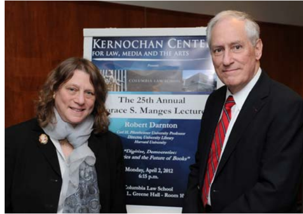
Jane Ginsburg, Faculty Director of the Kernochan Center with Manges lecturer, Robert Darnton

Prof. Darnton ended his talk with the promise that the DPLA will be up and running within the year.