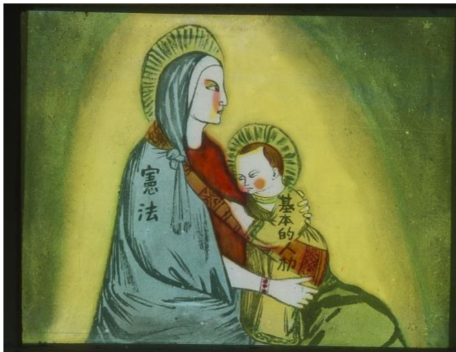
Granted something precious: the “constitution” holds “basic human rights”

The Association distributed twenty million copies of its 1947 book, Atarashii kenpō akarui seikatsu [New constitution, bright life], which included “then” and “now” diagrams of the change in the political system, with the people ruled from above (then) and the people electing the Diet (now). 42