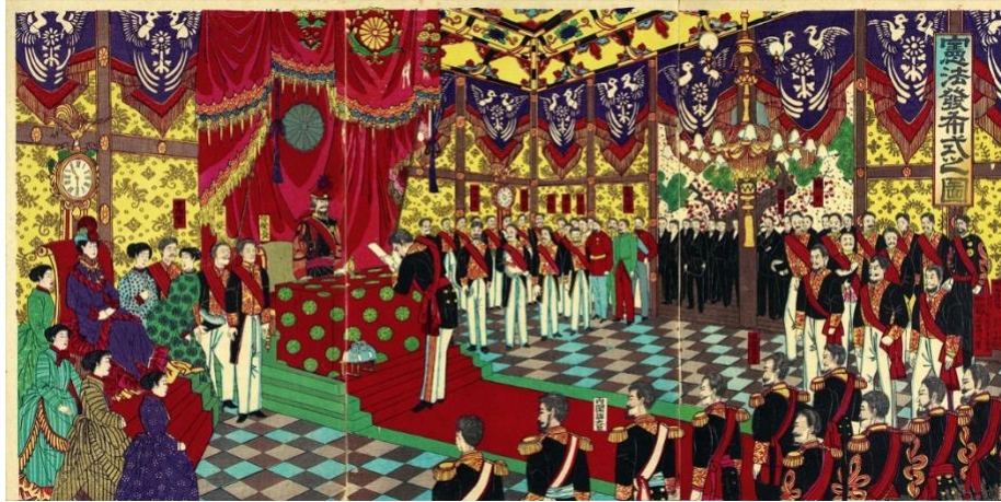
Illustration of the Ceremony Promulgating the Constitution, artist unknown (1890) 19

Few understood the meaning of the festivities: one man expected that the celebration of the promulgation would, like other holidays, be repeated annually; others copied the text on scrolls and hung them high on the walls of their houses. Yet some two decades later, when the Meiji era ended in 1912, nearly everyone knew the word and many gave credence to the importance of the constitution. The now established political parties each had the word “constitutional” ( rikken ) in their names and were quick to hurl the epithet “unconstitutional” at the actions of the government. Students labeled their teachers “unconstitutional” when they overrode school rules, and geisha used the same insult about customers who did not pay what they owed. 20 The first of two political movements “to protect constitutional government” ( kensei yōgo ) occurred in 1912, and by the 1920s, its foreign models no longer relevant, it was simply the Constitution of the Empire of Japan. Although it remained a gift from the emperor, by then many more claimed its authority and felt empowered to speak in its name.