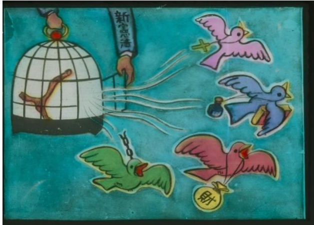
New human rights take wing under the “new constitution”